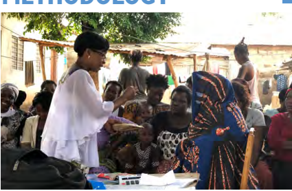
Partnerships and socio-economic inclusion

Thanks to ASSILASSIME, I have been able to grow my business considerably. The training sessions have helped me to boost my sales, and to keep better accounting records. The loans allow me to buy oil when the price is at its lowest. My profits are now much improved; I am able to save money and I have employed one of my neighbours. You know, I had to leave school very early - but I will be able to pay for my children to complete their schooling!