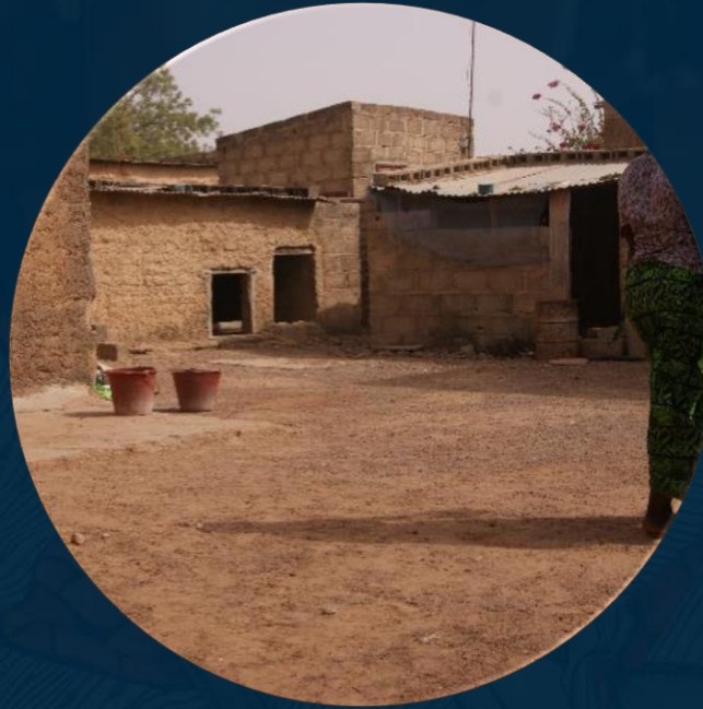
Isolated rural areas