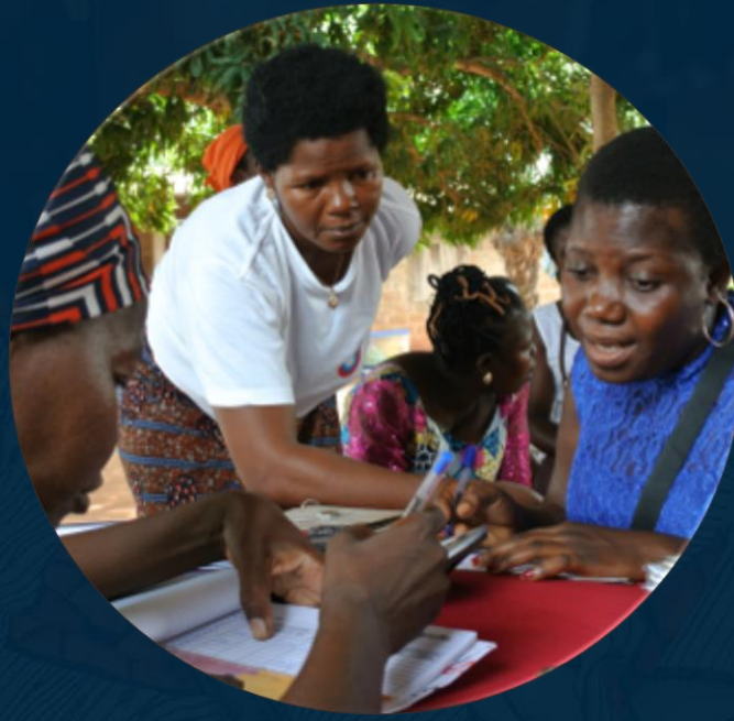
Micro-loan and savings